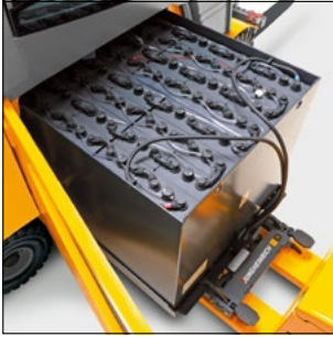
Lateral battery exchange